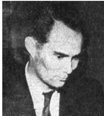
Alberic O'Kelly de Galway